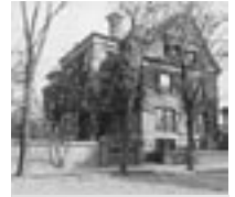
Sigma Chi, 3809 Locust Street, c. 1927

In September 2000, the chapter celebrated the 125th anniversary of its founding at Penn. It remains the 34th installed chapter within the Sigma Chi Fraternity and the fifth-oldest fraternity at the university. ■