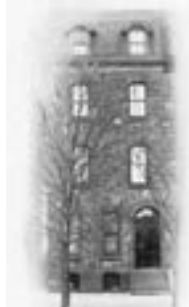
Sigma Chi, 3604 Walnut Street, c. 1905