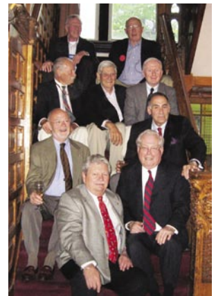
Members of the Class of '58 Gather on the stairs at the Chapter House

Want to have a reunion for your class? Use our online directory at www.phiphi-sigmachi.org to find old friends and begin making your reunion plans!