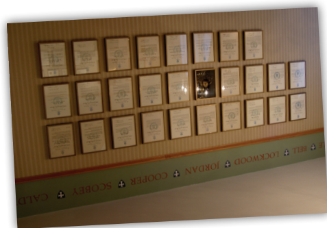
Phi Phi adds to its collection of Significant Sig plaques hanging in the Founders Stair hall.