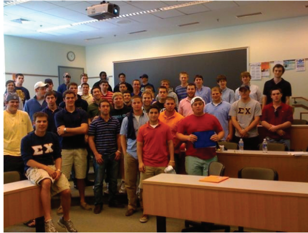
Brothers attended the Mid-Atlantic Provincial Conference hosted at Penn on April 4, 2010

Between our new members and our dedication to staying involved on campus and within the community, we are gearing up for a great finish to the school year and looking ahead to next semester with high expectations.