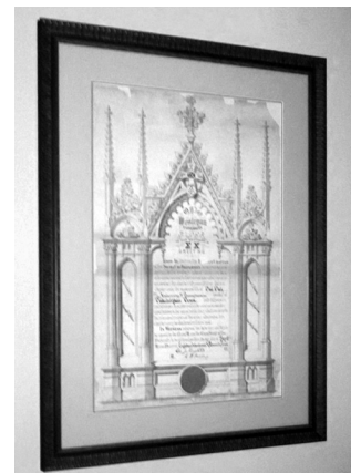
1875 Charter Reframed and Hanging in Chapter Room

This past summer, the House Corporation had this historic document, along with the 1912 Charter that founded the House Corp., both taken down and restored. Laser-scanned copies of each were reframed and returned to display at the chapter house. The original documents have been secured safely in archival storage. The Board is considering opportunities to make copies of these documents available to alumni.