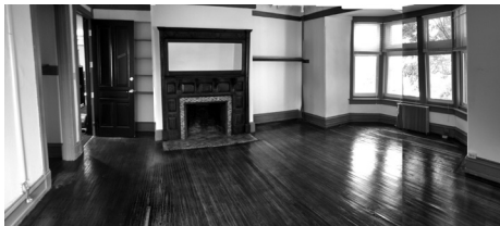
The Charles and Jamie Greene bedroom (The Gym) after restoration.