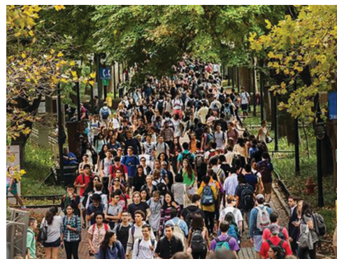
Locust Walk in the Fall

Our illustrious chapter was chartered in 1875 and moved a few times in its early years until a group of forward thinking alumni established the Sigma Chi Club of Philadelphia, our present day alumni House Corporation. In 1920 the Club's Board of Directors purchased our stately home at 3809 Locust Walk, the former residence of Anthony J. Drexel's daughter Frances and son in law, James William Paul. This fall, we will celebrate the 100th anniversary of the dedication of our beloved chapter house. This celebration is planned to coincide with Homecoming 2020 on the weekend of November 13-14th. This