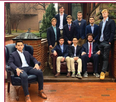
Fall Pledge Class

This past fall, Phi Phi welcomed another great class into our ranks. The fall pledge class, headlined by star players on the football, track, and lacrosse teams, has already made an immediate and palpable impact on the fraternity as the class has already begun to fill important roles within the chapter. With men whose goals range from